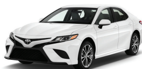
Toyota Camry Hybrid*