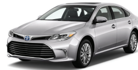
Toyota Avalon Hybrid*